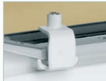
Peg stay clamp lock