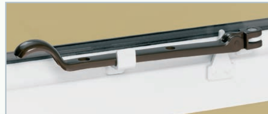
Brass RTD peg stay