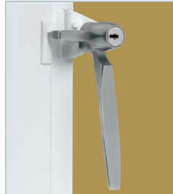
Satin chrome locking handle