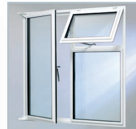
Homelight L Window

The Homelight L range is designed to enable compliance with Part L of the Building Regulations for England and Wales as amended in 2006 whilst still keeping the narrow sightlines and maximum daylight. Refer to our catalogue No 260. Steel Windows - revised PART L explained for more details.