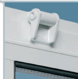
Top hung window hinge