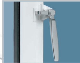
Satin chrome handle