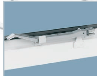
Satin chrome peg stay