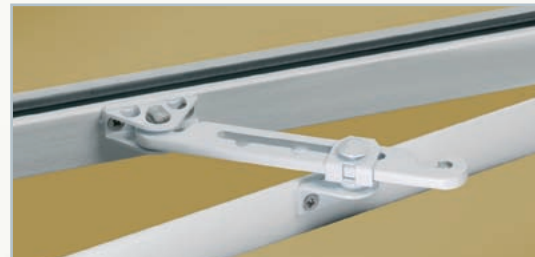
Kiddicare safety catch