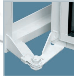
Easy clean window hinge