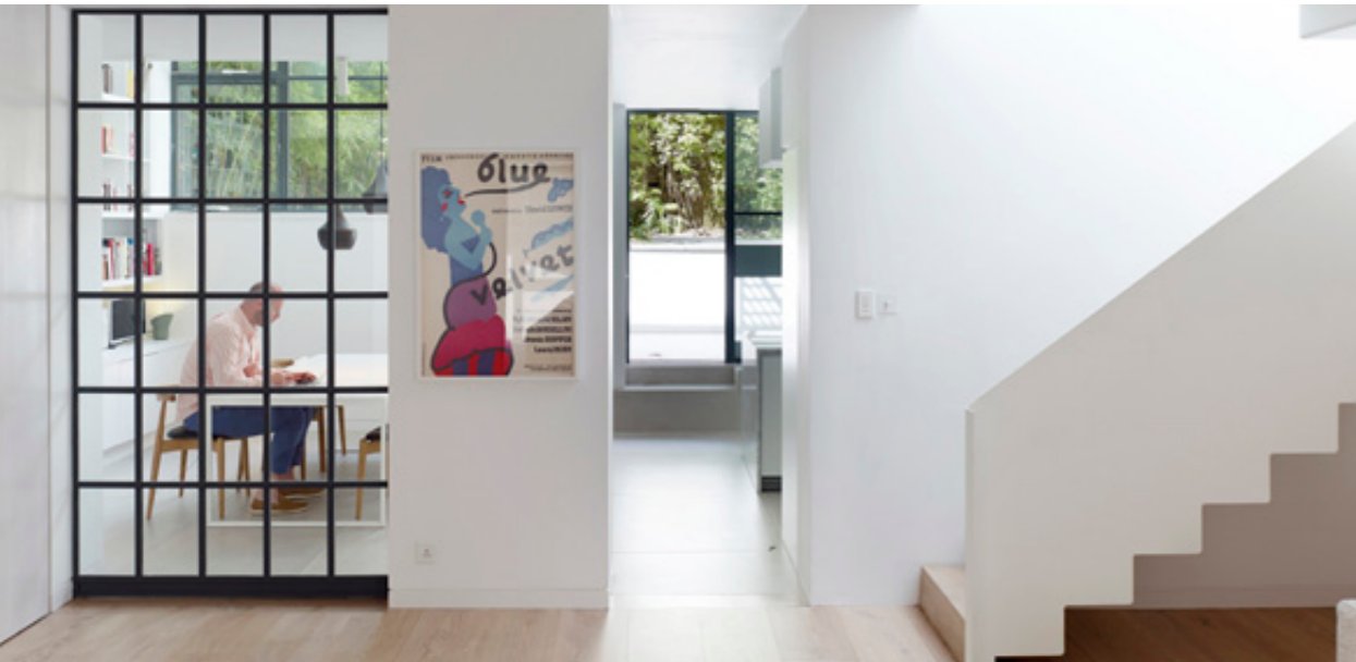
Stiff & Trevillion